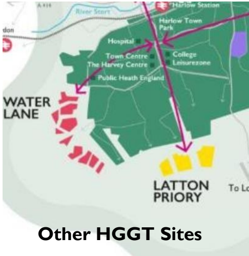
Other HGGT Sites